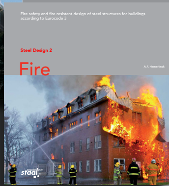
Steel Design 2